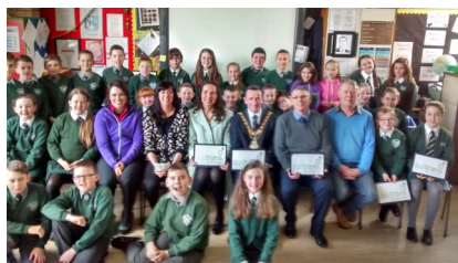
Pupils from St John's PS present their manifesto

Schools across the Causeway Coast & Glens area have been participating in the Big Street Survey during the past term. The Big Street Survey is a curriculum resource produced by Sustrans; it allows children to investigate their local area, thinking specifically about the good and bad things which affect their journey to school. Pupils then work together to create a manifesto for change, which suggests five changes that will make their active journeys to school safer and more enjoyable.