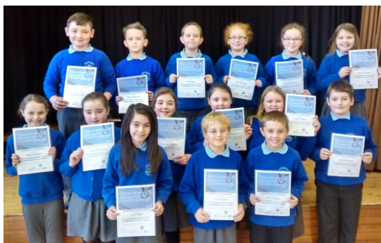
Pupils from Portstewart PS receive their Bikeability certificates

Bikeability Level 1 & 2 training is provided to 16 P6 pupils in each school that is part of the Active School Travel Programme. It takes trainees from the basics of balance and bike control (Level 1) to being able to plan and make a journey by themselves on quiet residential streets (Level 2). So far in this academic year, seven schools