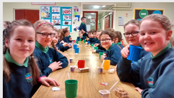
Pupils at St Ciaran's PS take part in an active travel break-fast, which was promoted by the school eco-council

Travel programme. However, there is plenty of work going on behind the scenes in schools, as staff and pupils work towards their bronze award. Pupils are encouraged to participate in sharing ideas about how to develop and promote active travel among their classmates – a number of schools have involved their student eco-council in this process. The students themselves make decisions, with the support of the dedicated school champion, about the kind of events they feel would benefit the school, and how they will promote active travel through the school community.