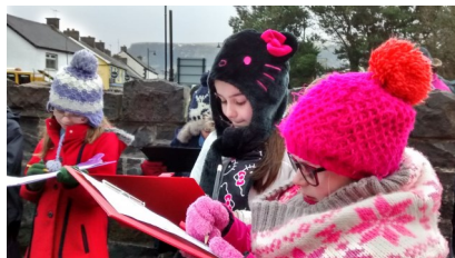
Pupils from St Patrick's PS, Glenariffe, and St Patrick's & St Brigid's PS, Ballycastle, conduct their fieldwork and work together to draw up their safe active travel manifestos.