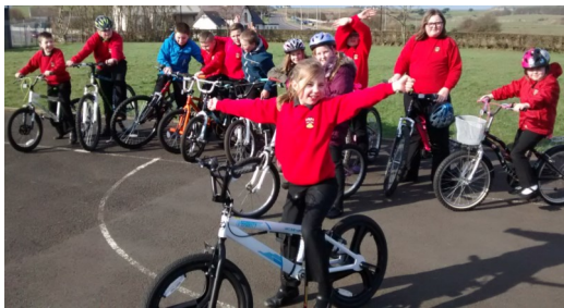
Pupils at Bushmills PS take part in a cycle skills session

Pupils across the Causeway Coast & Glens area have been participating in cycle skills playground sessions. These sessions use games and challenges to help pupils to improve their bike control and bike handling skills in a fun and safe way. Even with the weather as difficult as it has been over the past term, the kids have shown great enthusiasm in getting out on their bikes and taking part. We've had obstacle courses, emergency stop challenges, slow bike races, team competitions - it's amazing to see how much confidence and competence kids develop on their bikes as a result, and it's a great step towards eventually developing the knowledge and skills to cycle on-road safely.